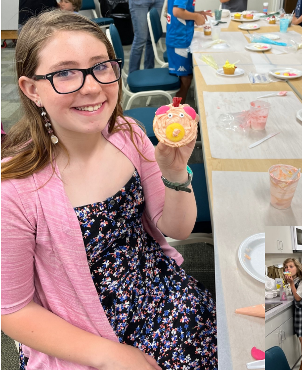
Clover/ Junior Barnyard Cupcakes Workshop