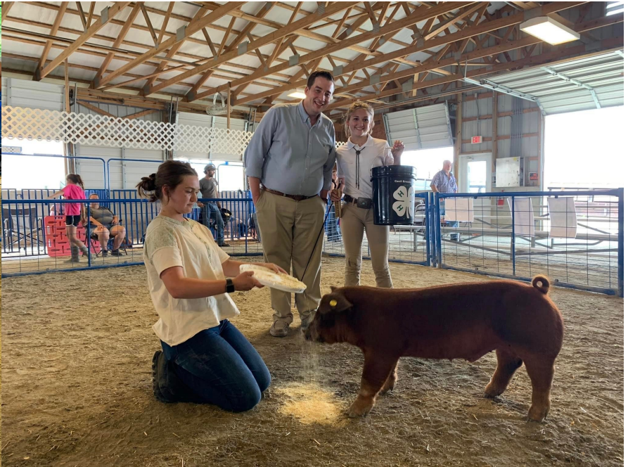
Harford county was well represented at the Cecil County Breeder's Fair!