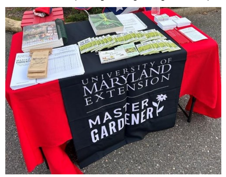
Photograph #2: Example of Table Setup

Be sure to have your Master Gardener handbook to use for reference when answering questions. If you are not able to answer a question, document the question and send it to the extension office for a response, or refer them directly to the local extension office. In our experience over the last year, the best handouts for public distribution are as follows: the local master gardener office contact information (for additional questions); soil test kits; vegetable and herb seed starting/sowing/harvest time frames; free seed packages, diagnosing common plant distresses; and composting.