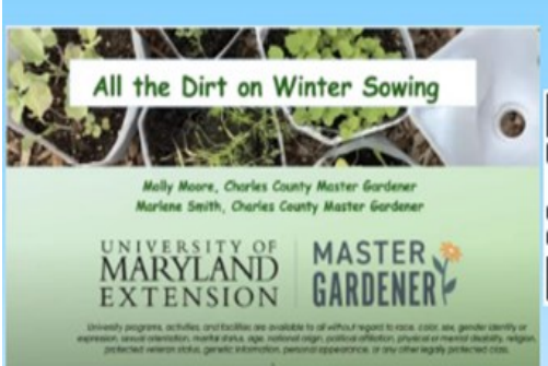
All the Dirt on Winter Sowing