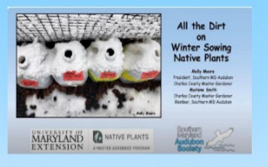
All the Dirt on Winter Sowing Native Plants January 2023