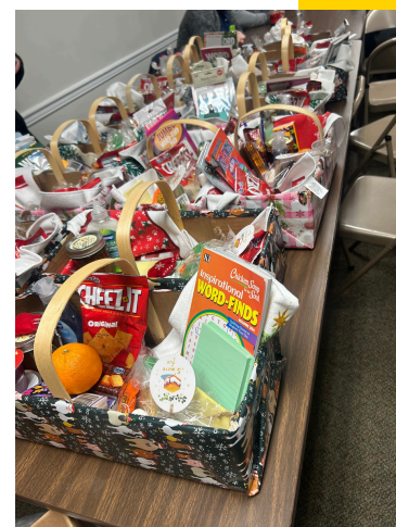
Gift baskets that were delivered during Christmas caroling