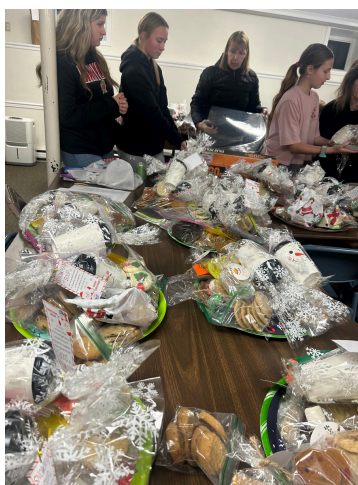
Cookie trays that were delivered during Christmas caroling