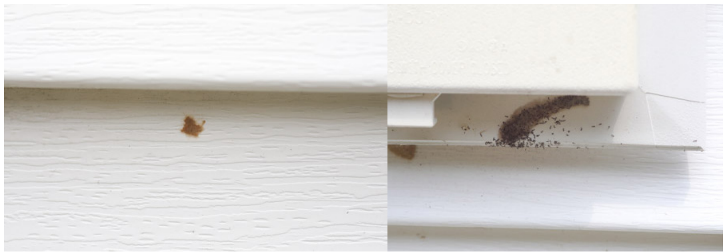
Fall armyworm egg mass (left) and just hatched caterpillars (right) on siding of a house