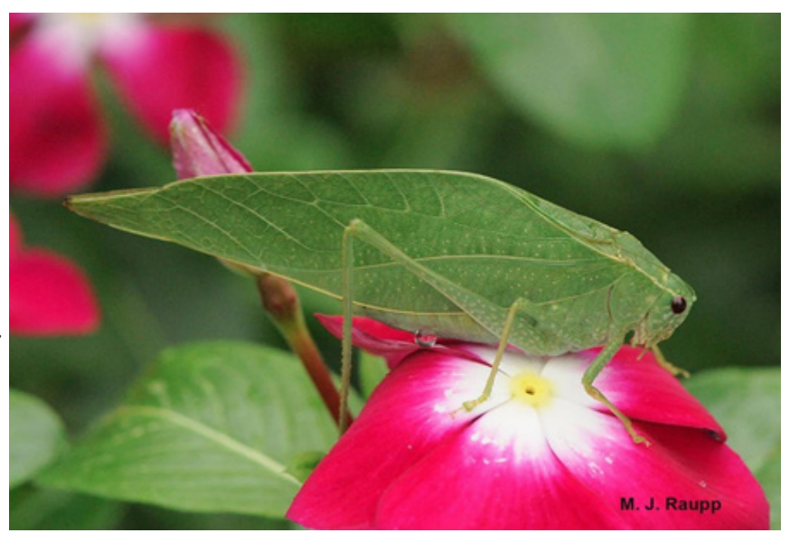
The wings of this male curve-tailed bush katydid, Skudderia curvicauda , have veins like a leaf.

Katydids are in the order Orthoptera and therefor are related to grasshoppers and crickets. Insects in this order have saltatorial legs which are long and thin for jumping. Within the Orthoptera, katydids which are sometimes called bush crickets, are in the family Tettigoniidae. There are about 6,000 species of katydids and they occur throughout the world, except Antarctica. In North America, there are around 255 species. Species range in size from 0.5" to over 5". Katydids can most easily be distinguished from grasshoppers by their antennae. Although both have what are referred to as filamentous (straight) antennae, katydid antennae on thin and longer than their body length, whereas grasshopper antennae are thicker and usually much shorter (not longer than their body). Adult female katydids have