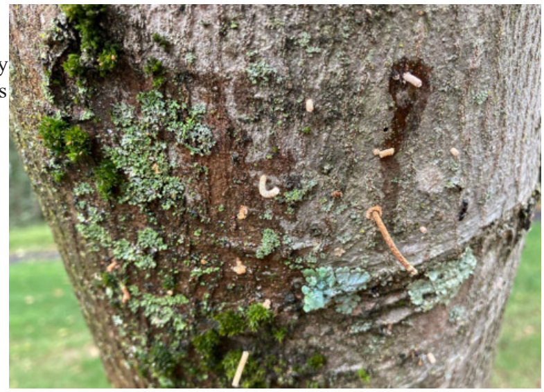
Frass tubes on this red maple trunk are a sign of ambrosia beetle activity

Elaine Menegon, Good's Tree and Lawn Care, found active ambrosia beetles on a red maple on September 22 in Hershey, PA. It's likely that activity is finished in Maryland, but if you do see frass tubes in Maryland, let Stanton know at sgill@umd.edu.