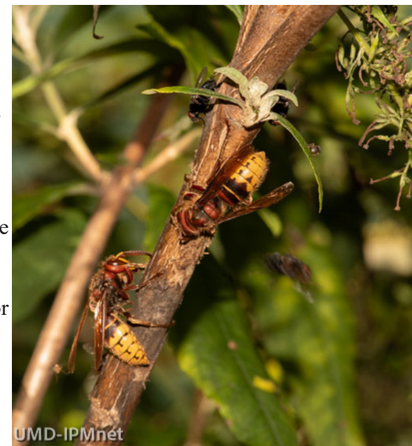
European hornets scraping off the bark of a buddleia stem

This year is turning out to be a big year for "insect outbreaks". We continue to get an unusual number of reports of European hornets attacking customers' fruit, especially apples, pears, and figs this week. People are reporting that when they are harvesting, they are being stung and are obviously not happy about the situation. Many reports of run-ins with these large European hornets is resulting in painful stings. The interesting thing is several people reported European hornets flying about at night. If you turn on a light, they show up rapidly and migrate toward the light source. I went outside to cut some Limelight hydrangeas in the dark using a flashlight. Within 30 seconds, I had European hornets buzzing about. The reports are correct – they do fly at night, which is rather unusual for many Hymenoptera species.