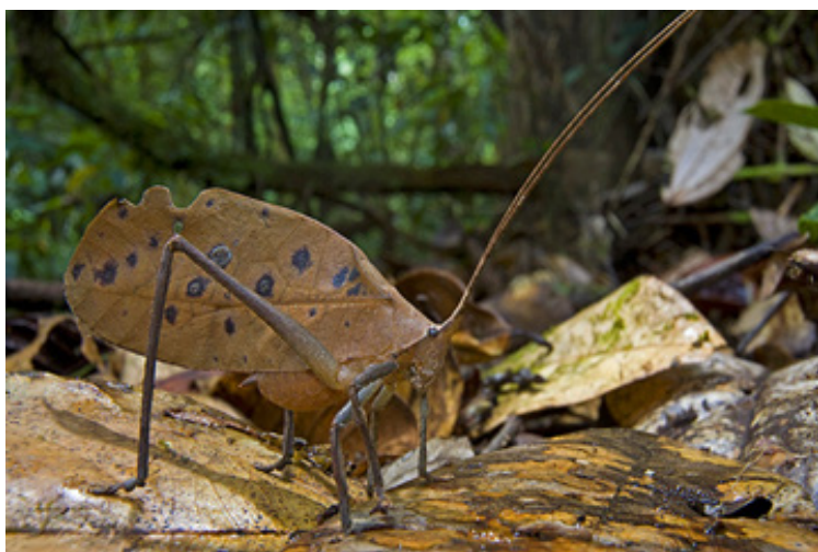
The peacock katydid, Pterochroza ocellate , mimics a dead leaf, leaf spots and all, protecting it from predators.

In a study by Morrison et al. (2016) they examined which predators were eating, and who ate the most, eggs of brown marmorated stink bugs (BMSB) in apple, peach, and vegetable crops. It is well known that ground beetles (carabids) are common predators in many systems and they did find that they were significant predators of BMSB egg masses. Of particular interest, they found that katydids readily consumed BMSB egg masses and lots of them. In their study they found both the straight-lance meadow katydid, Concocephalus