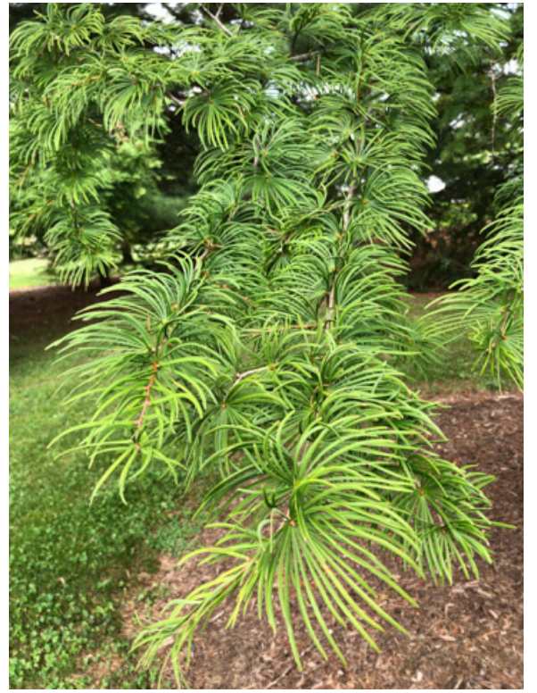
The foliage of Pseudolarix amabilis or golden larch turns light gold in autumn