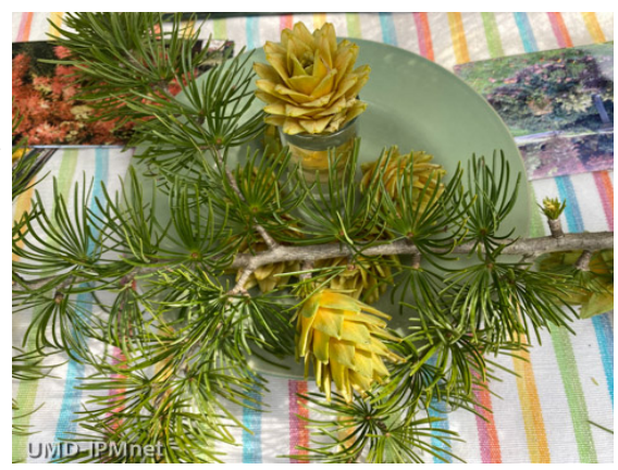
Cones of golden larch as part of a table display

Pseudolarix amabilis or golden larch is a deciduous conifer that can grow 30-60 feet tall and 20-40 feet wide. The foliage is soft blue green on the top of the needles and light green on the underside of the needles, and turns a golden yellow with the cold temperatures of late autumn. The gracefully arching needles are grouped in whorled clusters. Golden larch has both long and short shoots with needles spaced widely on the long shoots and in dense whorls on the short shoots. The blue green cones resemble small globe artichokes and sit on top of the branches. In the autumn, they turn light gold and open to release their ripened winged seeds, then quickly disintegrate and fall to the ground. The plants prefer full sun and moist but well drained soils and are tolerant of air pollution. These slow growing trees are cold hardy in USDA zones 4-7, and are tolerant of the heat