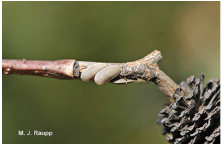
Katydids often deposit several eggs in rows on small branches of trees and shrubs.