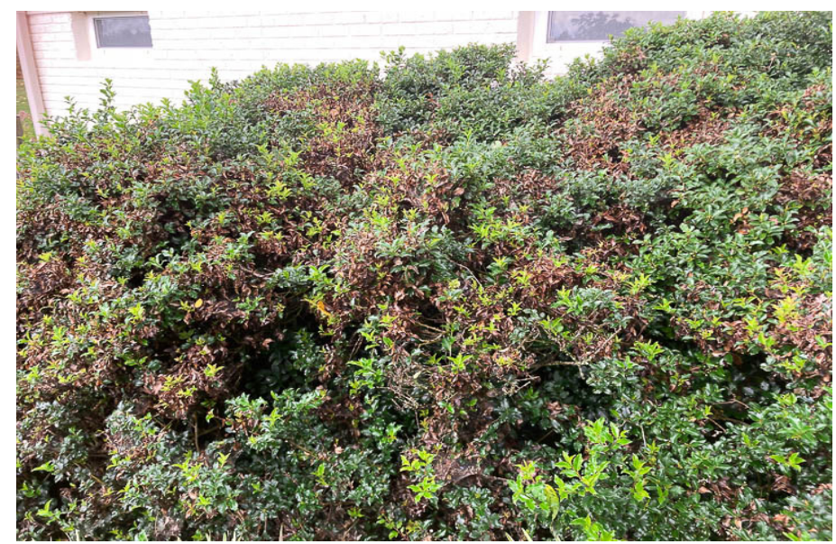
Web blight on blue holly

Management: When possible, thin and prune foliage to improve air circulation. Avoid overhead watering in late afternoon or early evening