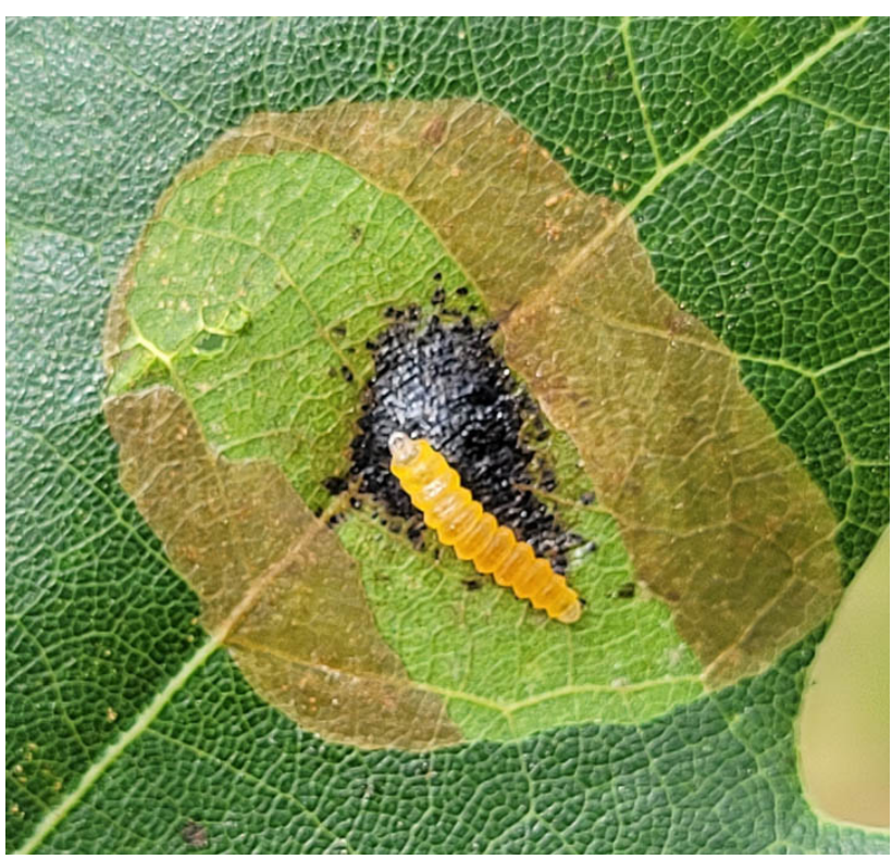
The solitary oak leafminer within its mine and exposed.