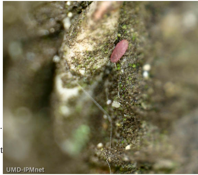
Look for the purple crawlers of Japanese maple scale

The time for action has arrived. The second generation crawler period