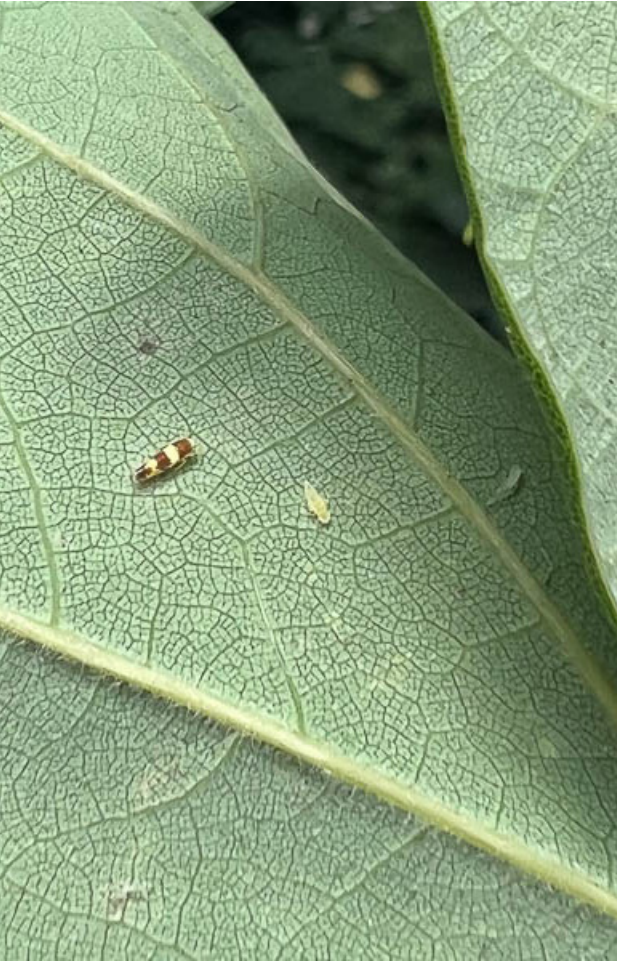
Leafhoppers (Erythroneura tricincta) are causing heavy stippling damage to redbud foliage.