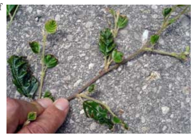
Symptoms of mouse-ear nickel deficiency in river birch.

At the turn of the millennium, research in pecan orchards showed that a common growth malady called Mouse-ear (rounding of normally pointed leaflets), was being caused by nickel deficiency, brought on by years of zinc sprays to correct zinc soil deficiencies. Nickel, zinc and copper are known to