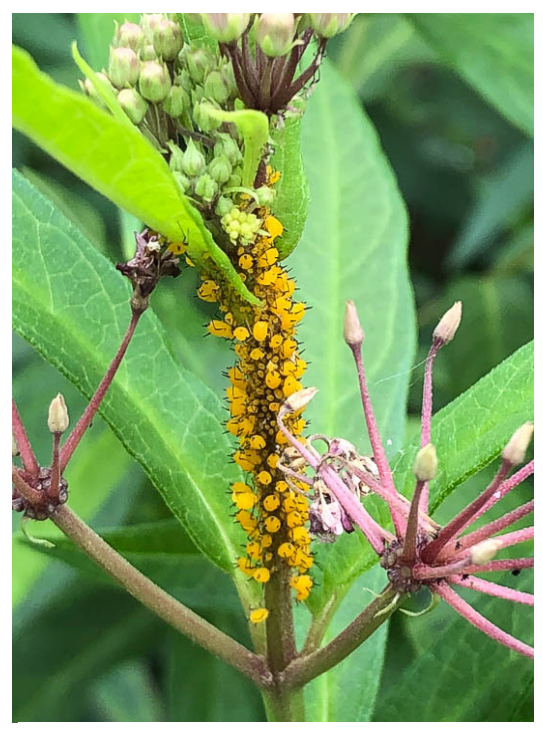
Oleander aphids covering the stem of milkweed.

We are receiving several pictures of oleander aphids on Asclepias plants this week. Asclepias plants have become popular for people to plant out for monarch butterfly larvae. There has been a corresponding increase in oleander aphids showing up with all of these plants as a food source being placed out into landscapes. Most insecticides would impact the oleander aphids, but they would also have a negative impact on the monarch larvae. It's not wise to use an insecticide for the aphids. One biological control you could try is releasing lacewing larvae to feed on the aphids.