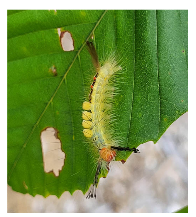
White-marked tussock moth caterpillar feeding on beech foliage