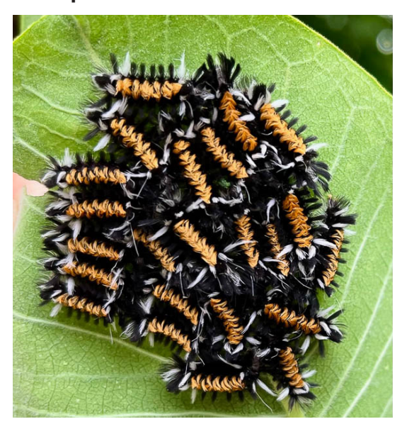
Milkweed tussock moth caterpillars