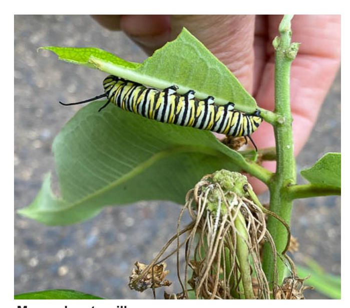
Monarch caterpillar