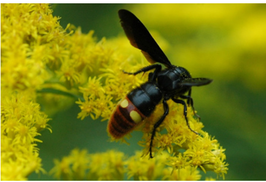
Scoliid wasp adult (Scolia dubia shown here) feed on the nectar of a variety of flowering plants.

have blue-black wings (2 pairs like most Hymenoptera) and black bodies except at the end of the abdomen, which is reddish brown and hairy with two distinct yellow patches. Scolia dubia mainly attack scarab grubs of green June beetle and Japanese beetle. These scarab beetles lay eggs in the soil of turf, garden beds, nursery stock, and grassy fields. Scarab eggs hatch and white grubs are active in the root zone into October. Scoliid wasp adults are most abundant and noticeable during August. Scoliid wasps fly several inches above turf infested with white grubs, often flying in a figure eight pattern. This figure eight flight is a courtship dance used to communicate with and attract mates. When flying over the turf, amazingly the female is able to locate a grub in the soil. She then "digs" her way down to the white grub. Once