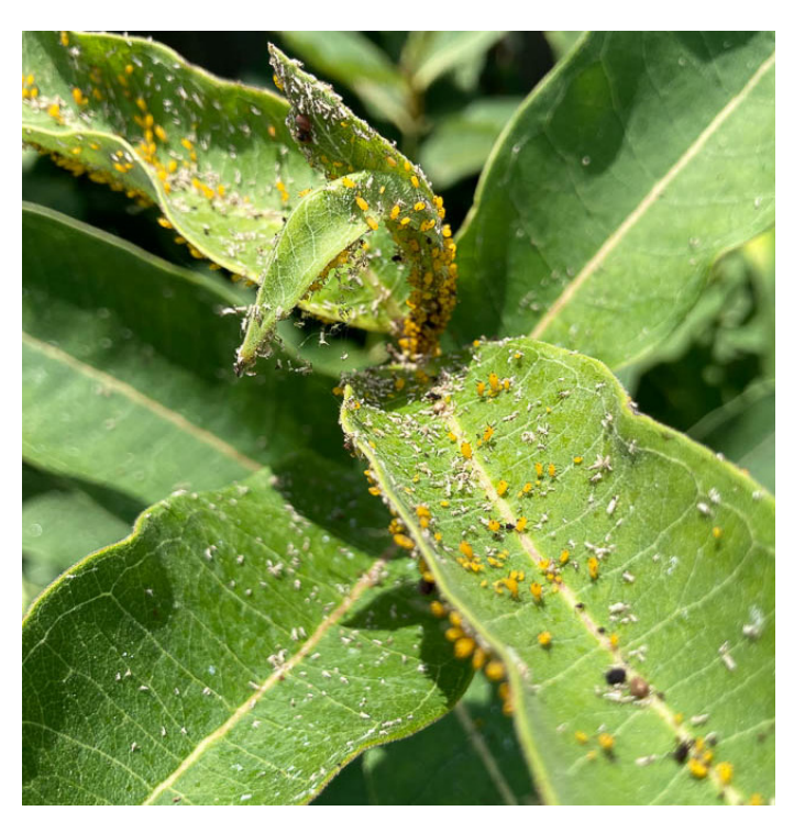
Oleander aphids on common milkweed; a few aphid mummies are present.