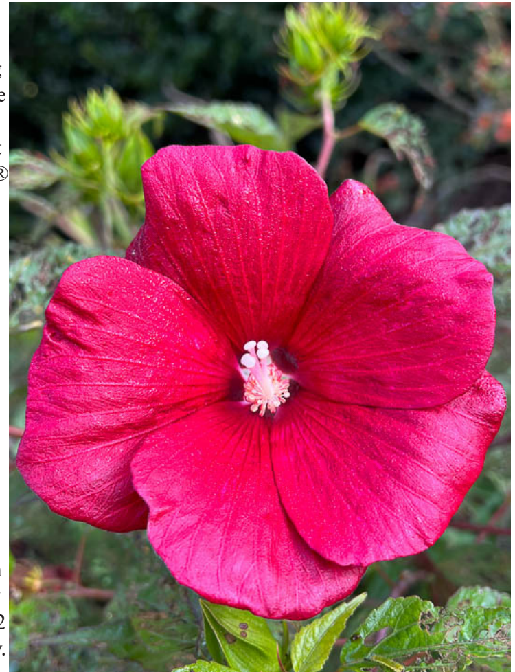
Hibiscus moscheutos 'WhitXX' or Cranberry Punch®

Hibiscus moscheutos 'WhitXX' or Cranberry Punch® is a dwarf herbaceous perennial hardy hibiscus that dies back each autumn and emerges very late in spring with new foliage. The hardy hibiscus always last of the herbaceous perennials to emerge from the cool spring soils, and they wait until the temperature are really hot in the mid to late summer to bloom. Cranberry Punch® is a hybrid of H. moscheutos by Dr. Carl Whitcomb, who also bred Flash Point® Swamp Hibiscus and many of the new crape myrtles including Dynamite®, Red Rocket® and Pink Velour®. The plants are cold hardy from USDA zone 5-9 and thrive in full sun, growing best in organically rich, moist soils, but tolerate most soils and can still bloom through droughts. They always bloom best with deep watering at least once a week. Plants grow 2-3 feet tall and wide with medium to dark green, shallowly serrated leaves that are triangular with 2 nodes near the stem. The leaves are arranged alternately along the green stems. Cranberry Punch® grows in a compact mound and holds their dark red, 4-5 inch rounded 5 petal blooms above the plants. The bright color attracts both pollinators and hummingbirds to the prominent showy stamen column. Each flower blooms for 1 sometimes 2 days, but new flowers bloom from large buds each day. The flower matures into seed capsules during the late summer or autumn, adding texture to the landscape. Cranberry Punch® can be grown in large containers, in