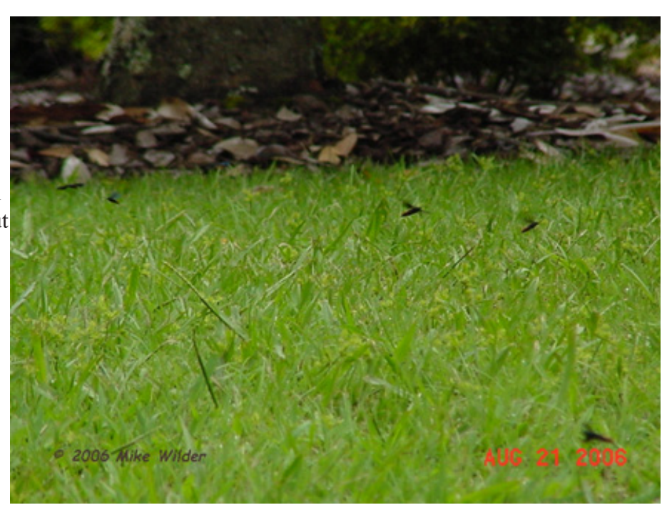
Scoliid wasp adults fly over turf grass in search of white grubs in the soil to serve as food for their young.