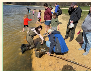
Club members learning about collecting aquatic insects.