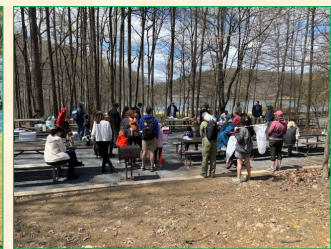
Club members collecting insects by the lake.