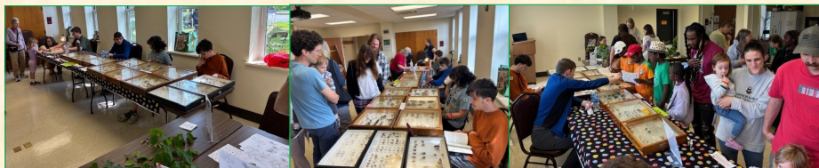
Members of the Entomology Club showing insects at Earth Fest.