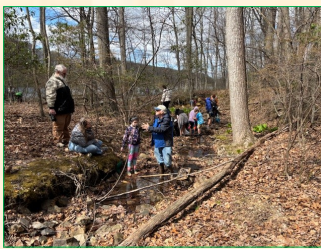
Club members collecting insects in the stream.

The members of The Entomology Club held their annual Stream and Lake Hike at the Greenbrier State Park on Sunday, 13 April. We walked in the stream and into the lake to look at and capture all kinds of interesting creatures. We managed to find nymphs of caddisflies, stoneflies, crane flies, mayflies, dragonflies, and beetles as well as frogs and salamanders. We released the frogs and salamanders, but kept some of the various insects that we will look at under a microscope at the Catoctin Creek Nature Center at our 18 May meeting. Members of The Entomology Club participated in the International iNaturalist City Challenge from 25-28 April where we tried to find as many creatures as possible and uploaded them onto iNaturalist.