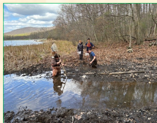
Club members playing in the mud at Greenbrier State park.