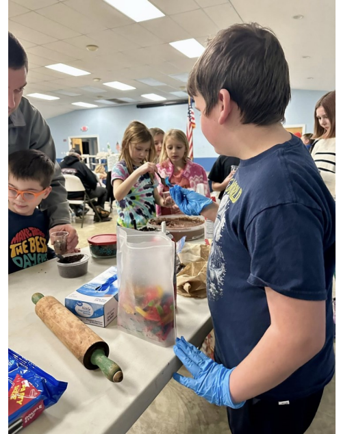
Tudor Hall's Valentine Sock Cupcakes for Discovery Commons Assisted Living Center & making dirt cups as a snack!