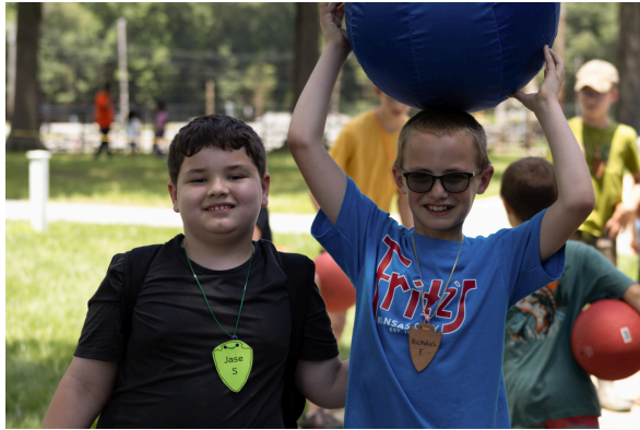
Day Camp 2025 Free Time

As summer comes to a close, we want to take a moment to thank our amazing volunteers and everyone who supported camp this year. Your time, energy, and dedication made this summer truly unforgettable for our campers.