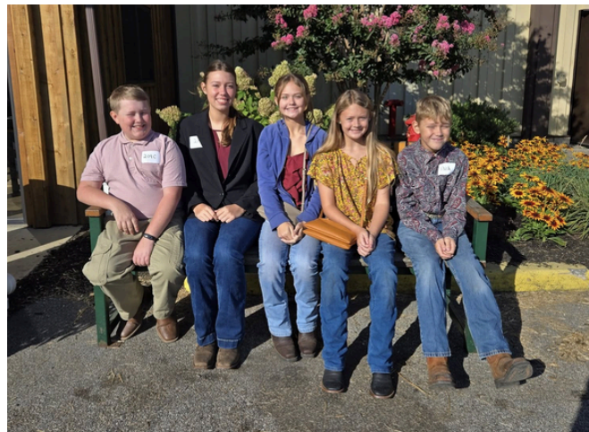
Livestock Judging Team