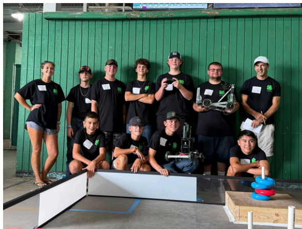
REC Senior & Intermediate Teams

https://thebaynet.com/charles-county-4-h-robotics-team-removes-10-bags-of-trash-from-gilbert-run-park/?fbclid=IwY2XiQwMjwxcleHRuA2FlbQlxMOABHl5Kl8fU55IAQlFeShy18xQ6UCBQ2KAPsgf54TgiVndltRZVdlUbchpUn5S_aem_zbrz92V2Dl_cjskcZhxtIA