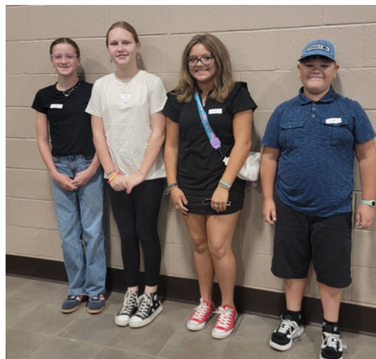
Poultry Judging Team