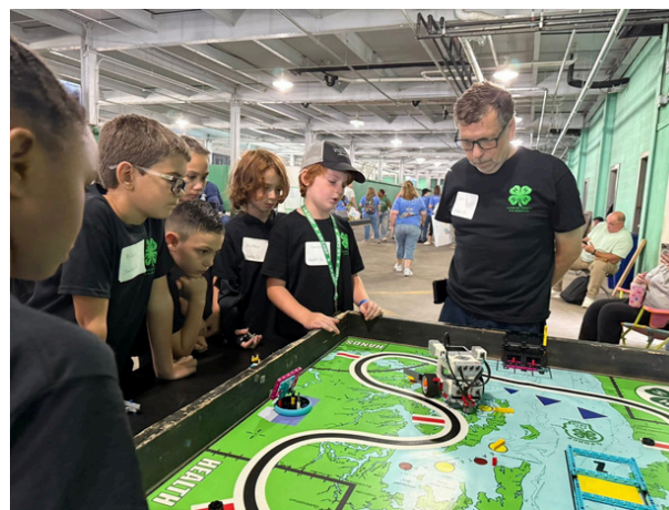
Junior LEGO Team at the MD State Fair

https://www.youtube.com/watch?v=ZVykirNhNJU