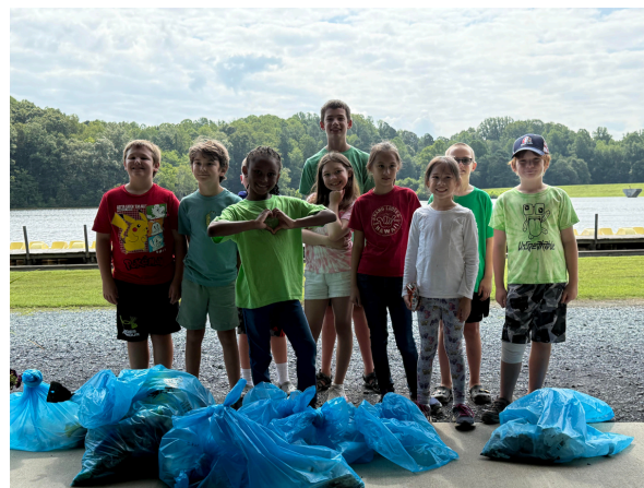
LEGO Teams gathering trash at Gilbert Run Park