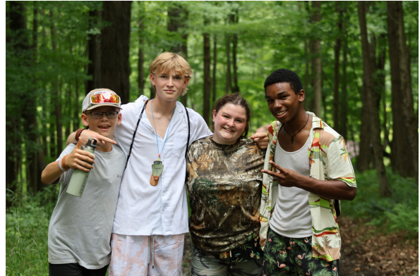
Overnight Camp 2025 Counselor Hunt