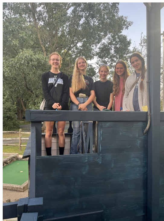
Members of our Teen Leadership Council enjoyed playing miniature golf!